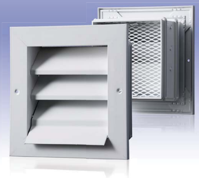
Supply and exhaust ventilation grille with fixed vanes