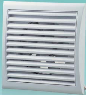
Axial fans for exhaust ventilation with air capacity up to 78 m 3 /h