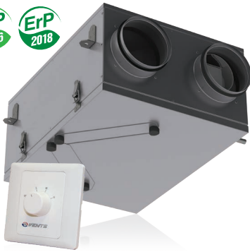
A3 speed switch

Air handling units with heat recovery in the compact sound- and heat-insulated casing. Air flow up to 100 m 3 /h . Heat recovery efficiency from 64 up to 76 %.